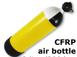
CFRP air bottle 2 liter/300 bar carbon fiber. Replacement for steel bottle(s). Weight reduction: 2 kg!