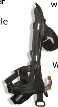
Backpack with adjustable straps and quick-release fasteners. Assembly kit included Weight: 1.4 kg