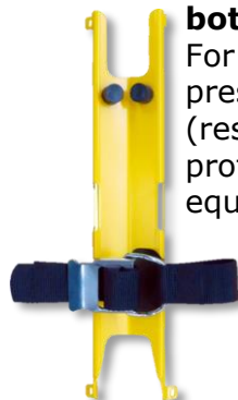
Additional bottle holder For second pressure bottle (respiratory protective equipment)